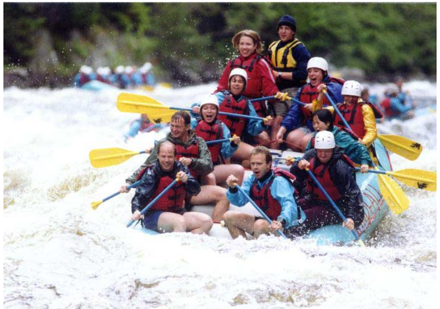
Euros at Kennebec River, July 16 2000

After the sunset, we split into 3 groups. One group decided to check out the hot tub located behind the lodge, and the other two groups left for an evening of Maine's favorite sport - moosewatching. Yes, sir, those are the large elk-resembling herbivores with shovel-like antlers. One moosewatching group saw 3 moose and the other 11, including the calves, mostly along the nearby roads. One had to be pretty careful driving when moose are around, but drivers were careful (and properly instructed), and thus collisions or moose fights a la corrida did not occur.